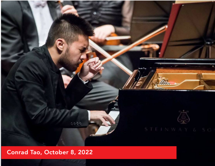
Conrad Tao, October 8, 2022