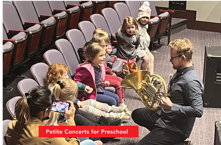
Petite Concerts for Preschool

The South Dakota Symphony Orchestra is committed to making the music we share accessible to everyone. Every year, the Dakota String Quartet and the Dakota Wind Quintet provide music education programs and performances in partnership with local and regional school districts, community centers, and health care facilities.