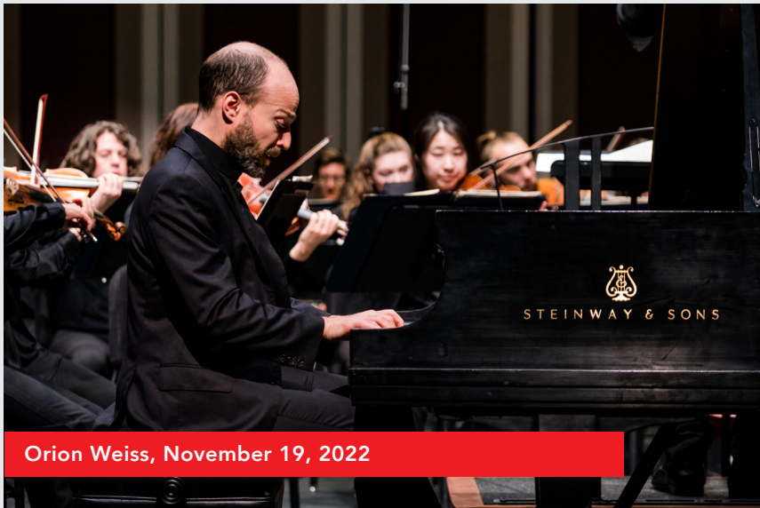
Orion Weiss, November 19, 2022