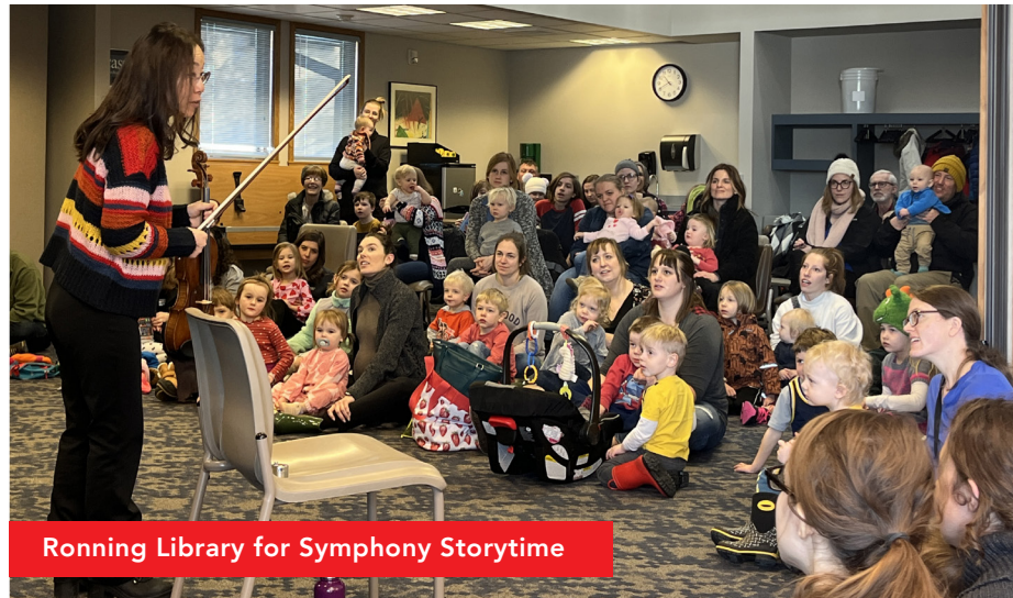
Ronning Library for Symphony Storytime