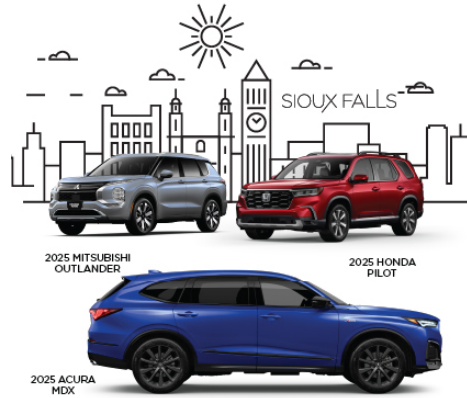
2025 MITSUBISHI OUTLANDER

GIVING BACK TO OUR COMMUNITY - ONE CAR DEAL AT A TIME.